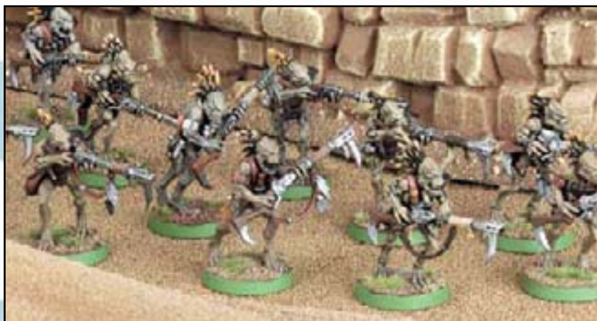
Mercenary Kroot advance through a rocky valley.

Fieldcraft: Kroot are naturally adept in arboreal environments and gain +1 to their cover save in woods or jungles. Kroot in woods or jungles do not have to make a difficult terrain test, they can always make a normal move. If they do not move in the Movement phase, they may see and shoot through 12" of woods or jungle terrain rather than the 6" that would normally be the case.