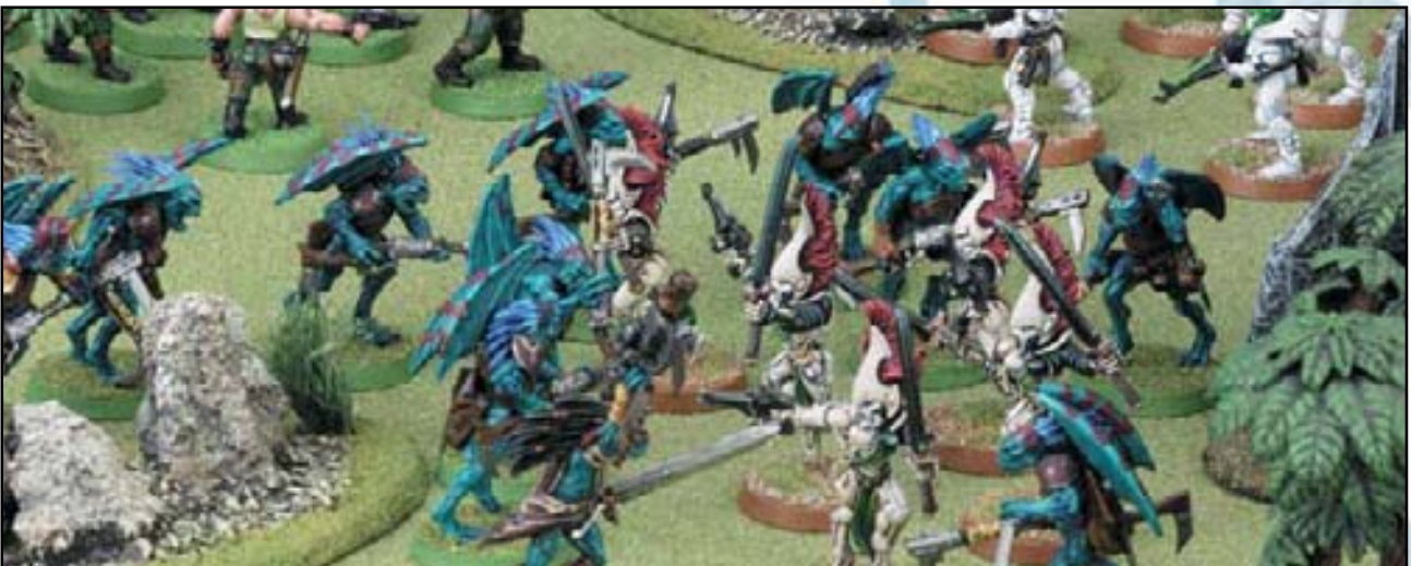
A Kroot Mercenary warband assists the Imperial Guard in staving off an Eldar assault.

Special rules: Punji traps are generally a small pit containing sharp stakes and covered with foliage. Place the small Blast marker over the model that triggered the trap so that the hole in the marker is over the model. Any models fully under the Blast marker are hit automatically, and any partially under are hit on a 4+.